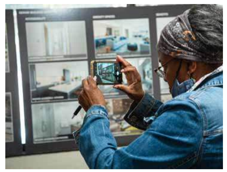
Shareholder resident studies designs.